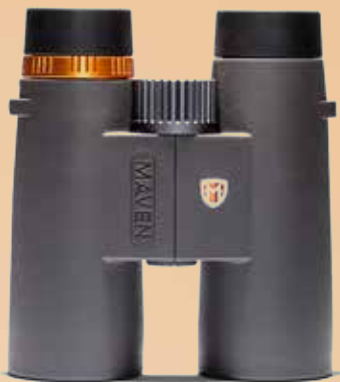
Maven Optics C1 10X42