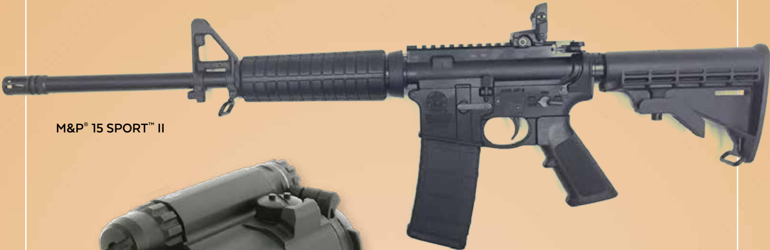
M&P® 15 SPORT™ II