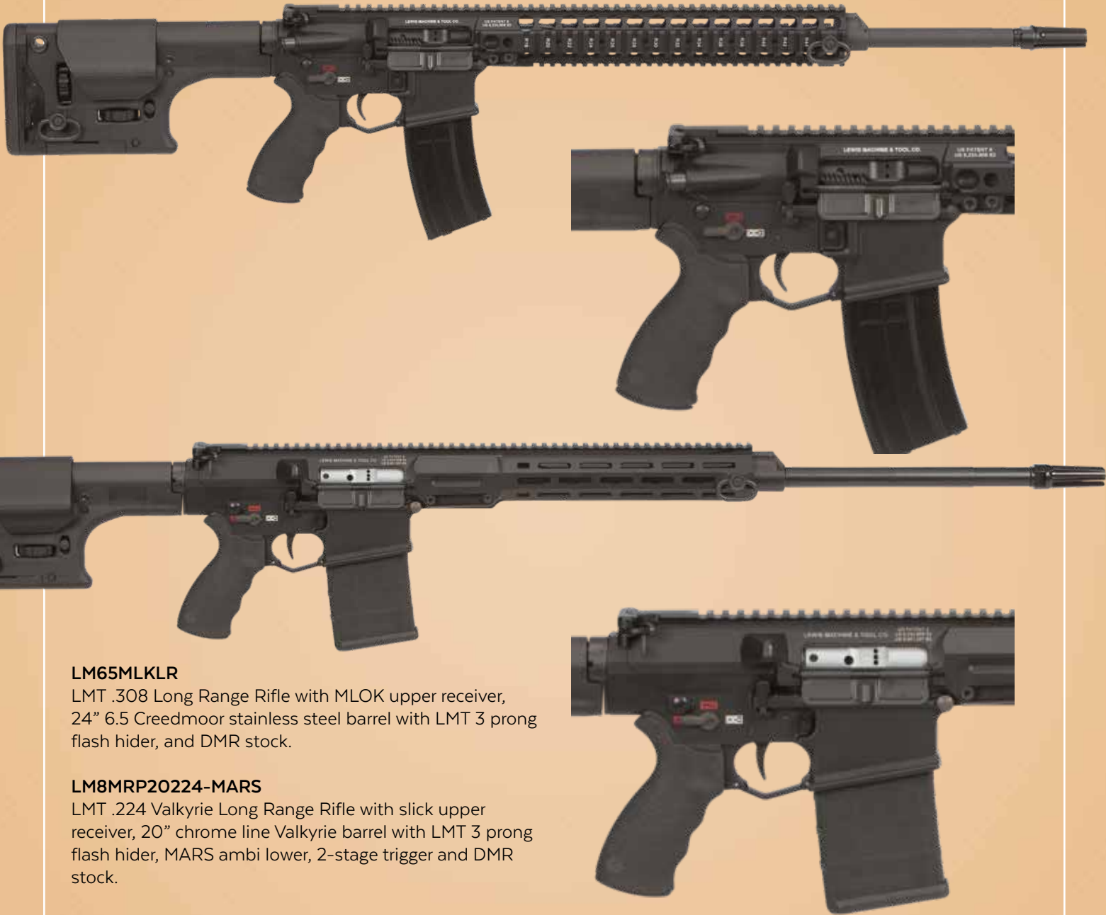
LM65MLKLR LMT .308 Long Range Rifle with MLOK upper receiver, 24" 6.5 Creedmoor stainless steel barrel with LMT 3 prong flash hider, and DMR stock. LM8MRP20224-MARS LMT .224 Valkyrie Long Range Rifle with slick upper receiver, 20" chrome line Valkyrie barrel with LMT 3 prong flash hider, MARS ambi lower, 2-stage trigger and DMR stock.